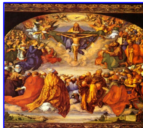
The Communion of the Saints

Every year the Church recalls the example, witness, and prayer of the holy women and men who have been identified by the Church as Saints. These saints are more than just role models; they are family members with whom we continue to share relation, in a bond of prayer, called the Communion of Saints. Every year when we celebrate this day, the Gospel we proclaim recalls for us Jesus' teaching about happiness, the Beatitudes. We quickly note in this reading that none of those Jesus names